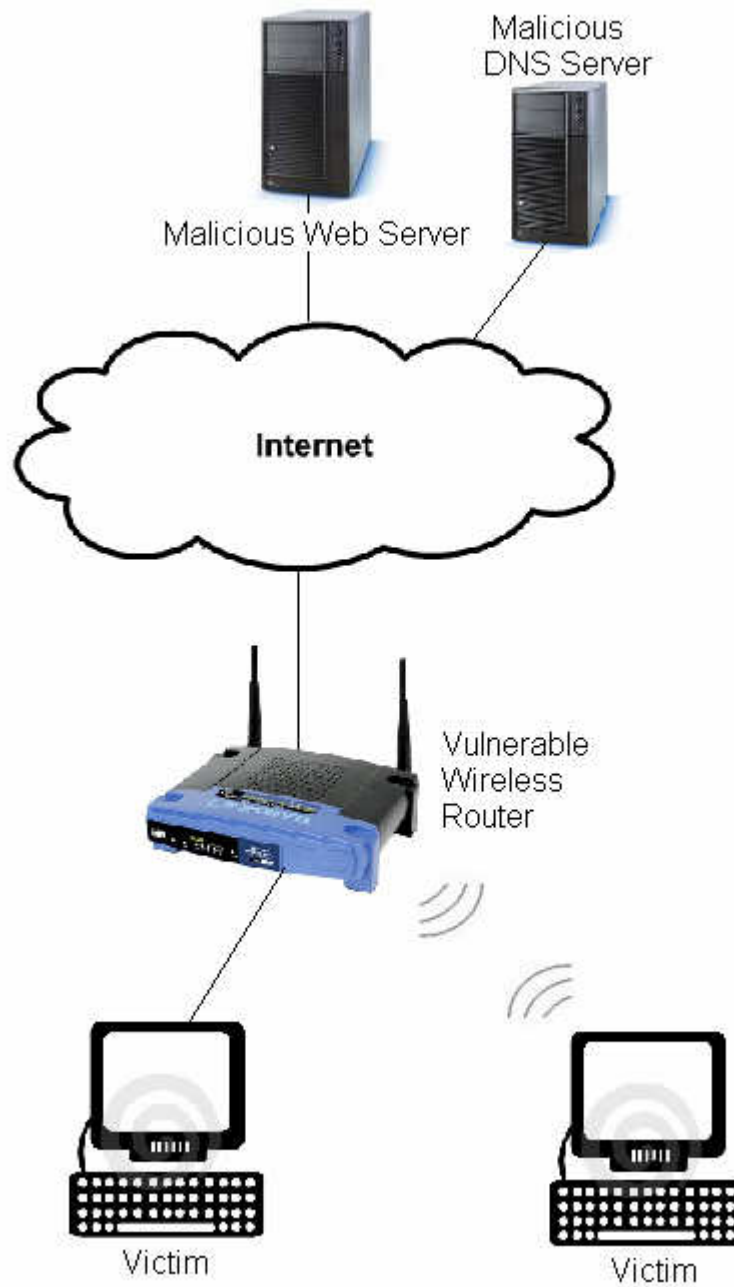
Figure K.1: Full Size Diagram of Attack Scenario